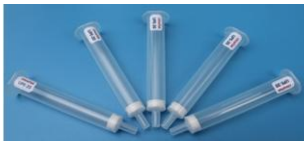
Figure(A). Typical Photo for UPE-20 cartridges

The Ultra-high Performance Extraction (UPE) cartridges are a novel type of solid phase extraction (SPE) cartridges manufactured by ChiralTek. The UPE particles were prepared through a specially-designed procedure by bonding C18 (ODS) and ChiralTek proprietary functional groups onto high-quality porous spherical silica particles. By using a ChiralTek proprietary packing approach, the UPE particles were then packed into kinds of polypropylene tubes with different sizes to manufacture several models of UPE cartridges for ultra-high performance solid phase extractions. The following Figure (A) shows a typical photo of model UPE-20 cartridges.