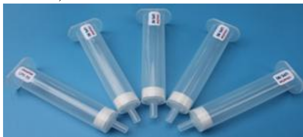
Figure(B). Typical Photo for UPE-90 cartridges

The UPE-20 model cartridges (specification: 20 mg/3mL, 120Å, 50 PCs/pkg) in Figure (A) are suitable for extraction of small volume samples (0.5 – 200mL). The sample capacity of the UPE-20 cartridges are equivalent to other supplier's 100-200mg/3mL ODS (C18) type of conventional SPE cartridges. Similarly, another model UPE-90 cartridges (specification: 90 mg/6mL, 120Å, 25 PCs/pkg) in Figure (B) are suitable for extraction of large volume samples (500 – 2000mL).