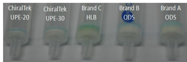
Figure(D). Comparison of column bed colour of different cartridges after loading same amount of Methyl Blue samples.

The ChiralTek UPE cartridges also exhibited much better recovery when compared to conventional SPE cartridges from other manufacturers. The following experiment was illustrated by the example of extraction of 1 ppm Methylene Blue in 3 mL water matrix. After being conditioned by methanol following by loading same volume of 3 mL of 1-ppm Methylene Blue solution, the color of the column beds of ChiralTek UPE, Brand A, B, C cartridges (3mL SPE cartridges) is shown in Figure (D).